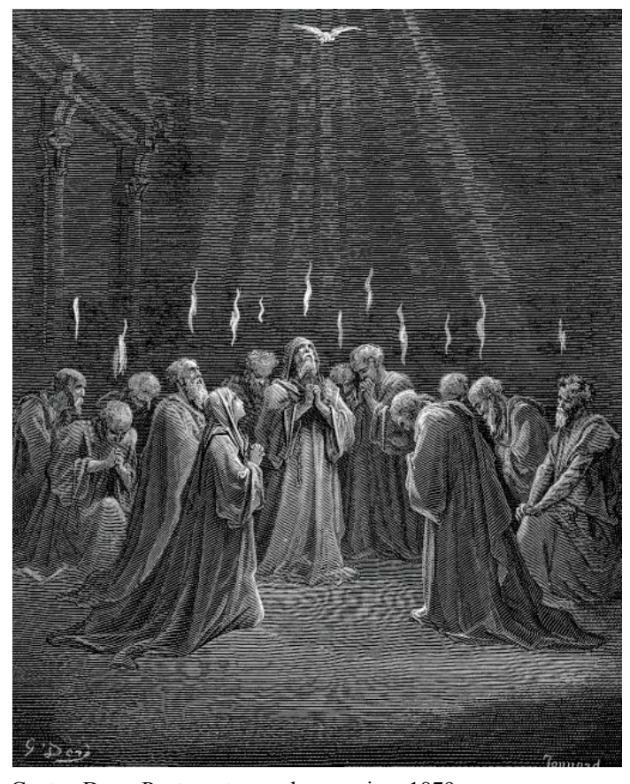
Gustav Dore, Pentecost, wood engraving, 1879

In the second chapter of the New Testament Book of Acts, an account is given of the day of Pentecost when the disciples "were all filled with the Holy Ghost, and began to speak with other tongues, as the spirit gave them utterance." The speakers were all Galileans but they were among a multitude made up of different nationalities. On that occasion, the people who were gathered all heard what was being said in their own language. Among the multitude were "Parthians, and Medes, and Elamites, and dwellers of Mesopotamia, and in Judea, and Cappadocia, in Pontus, and Asia." [Many other regions were named.]